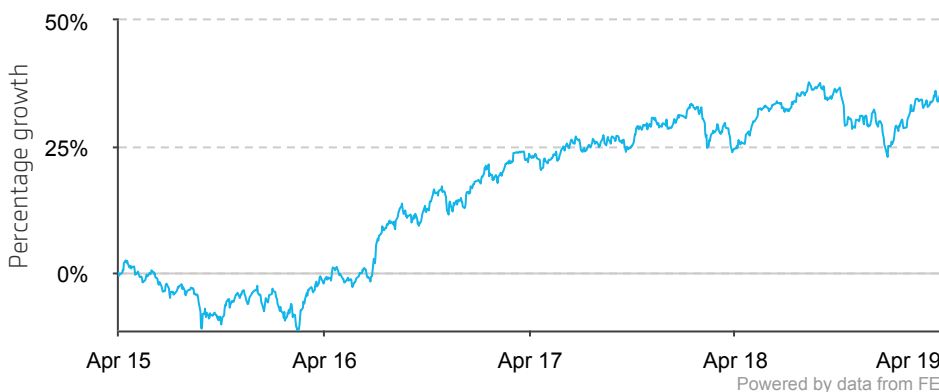
■ Aegon Mercer Target Annuity (ARC)

In the graph, performance is shown since launch if the fund is less than five years old.